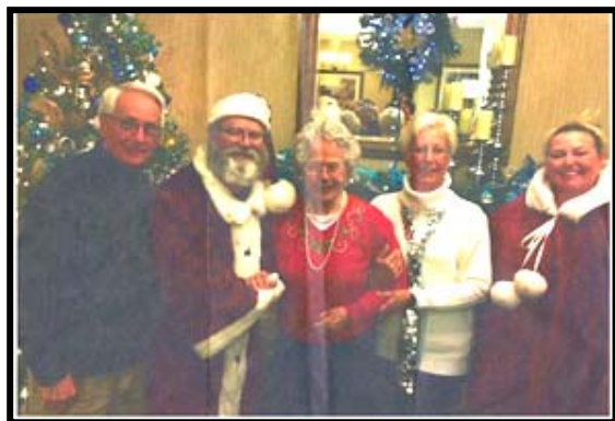
(The full picture is on the bulletin in the narthex).