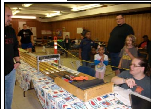
Cub Scout Pinewood Derby in Fellowship Hall