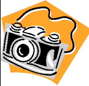
Lenten Vesper Service